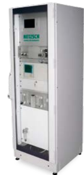
KBT 916 – Fire Testing for Cables