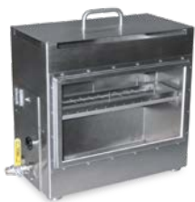
HBK – Horizontal Burner Box