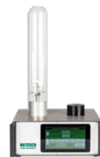
LOI – Oxygen Index Analyzer