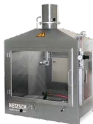
KBK – Small Burner Box