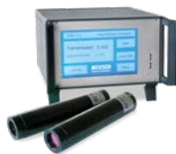
TRDA – Smoke Density Tester with light measurement system