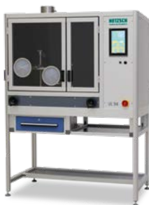
UL 94 – Fire tester