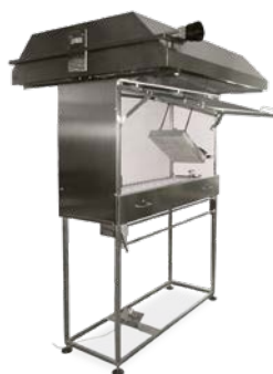
TBB 913 – Floor Radiant Panel