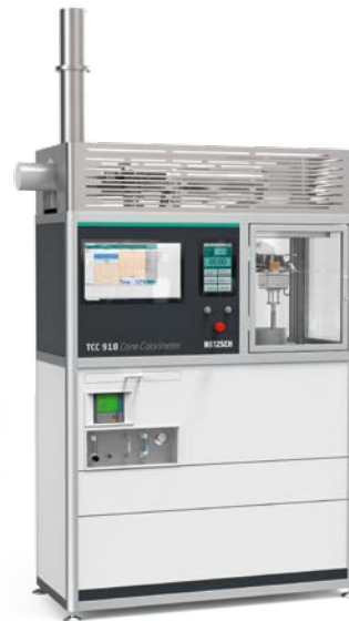
TCC 918 – Cone Calorimeter

The right choice of materials and components is crucial for fire protection and the spread of fires. Fire tests according to German, European and international standards for the classification of flammability and burning rate of materials for the construction, textile, automotive and electrical industries support product development. In compliance with product standards, NETZSCH tests flammability, the avoidance of rapid ignition and the generation of the lowest possible smoke development.