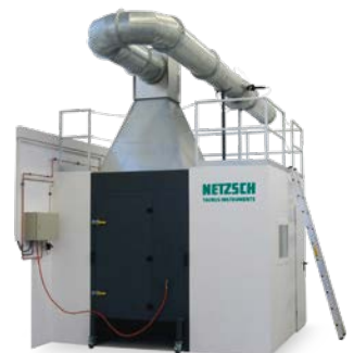
SBI 915 – Single Burning Item